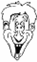
A. AUTHOR1 Organisation 1 Place 1