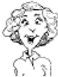
B. AUTHOR2 Organisation 2 Place 2