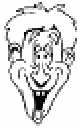
C. AUTHOR3 Organisation 3 Place 3